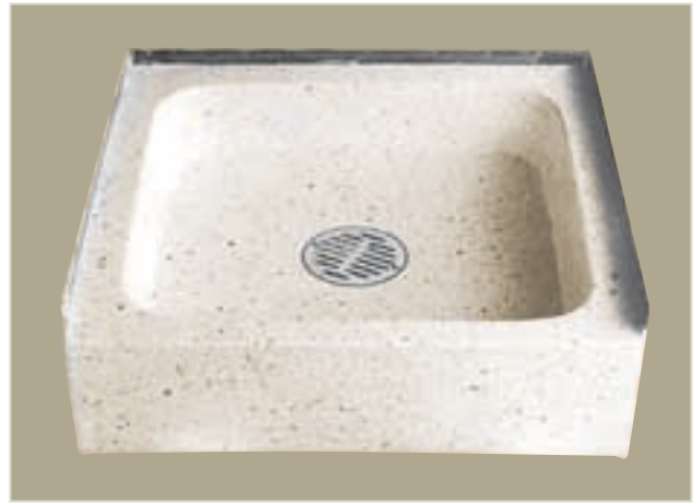
Shown: Model 40

2851 Falcon Drive • Madera, CA 93637 T. 559.661.4171 • T. 800.446.8827 F. 559.661.2070 • florestone.com