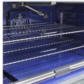
Blue Porcelain Interior