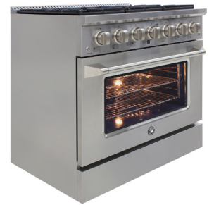
Stainless Exterior with Halogen Lights