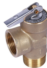
Pressure Relief Valve