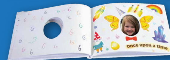
Photo Book - It's all about me

The smaller book includes a window. You can write a story about yourself, a friend, a family member or a favorite pet. Place your photo, drawing or a picture of your main character in the back of the book. Center the picture so it shows through the pages of your book.