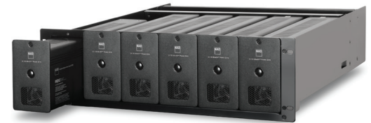
Six CI 720 mounted in RM720 rack (optional accessory)

The 60-watt per channel, single-zone CI 720 V2 Network Stereo Zone Amplifier with HybridDigital™ amplification technology is the perfect addition to today's most advanced custom home audio systems. Featuring 60 watts per channel, and powered by BluOS™, the advanced music management operating system, the CI 720 V2 allows you to access and stream 24-bit high-res music with the control of a smartphone or tablet via Ethernet and third-party control systems like Control4, Crestron, RTI and URC. The CI 720 V2 is now more flexible than ever with AirPlay 2 built-in for easy integration into the Apple ecosystem.