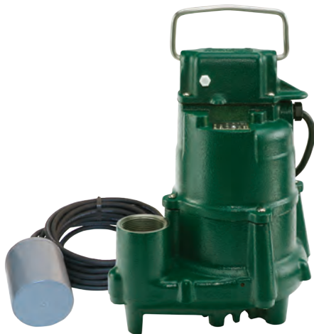
Nonautomatic model with piggyback

"Easy assembly" (pump & discharge pipe not included.)