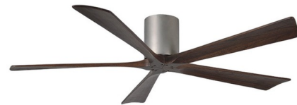
Shown in brushed nickel / walnut tone