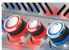
NIGHT LIGHT™ backlit knobs with SafetyGlow