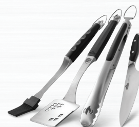
EXECUTIVE 4 PIECE TOOLSET #70037