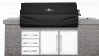
PREMIUM FITTED COVER #61826