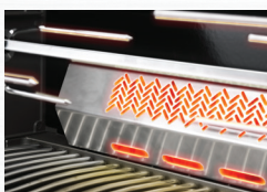
Rear Infrared Rotisserie Burner