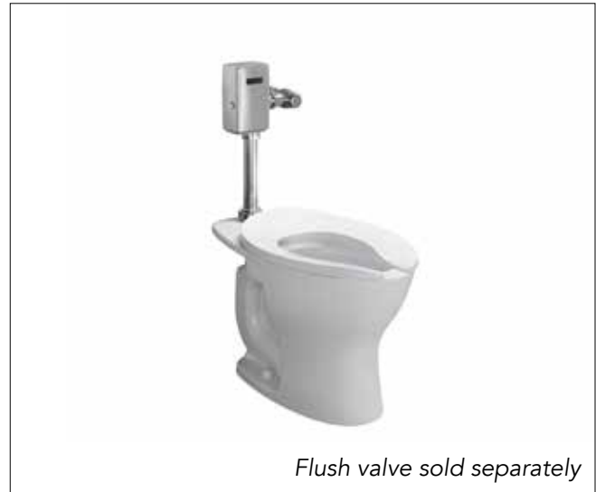
Flush valve sold separately