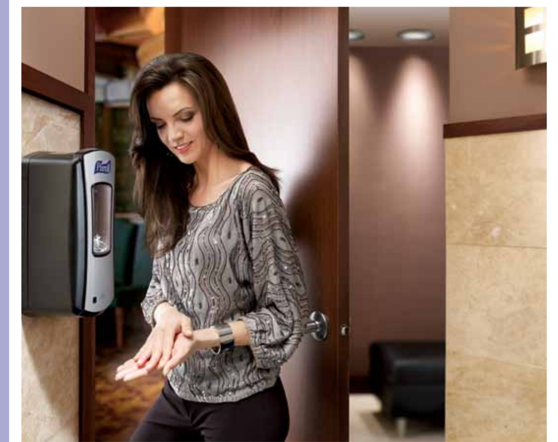
PURELL® PERFECT PLACEMENT at restroom exits.

Spotlight the value you place on GUEST and STAFF well-being.