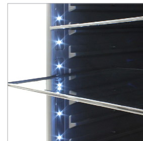
Glass Drawers and Interior Lights