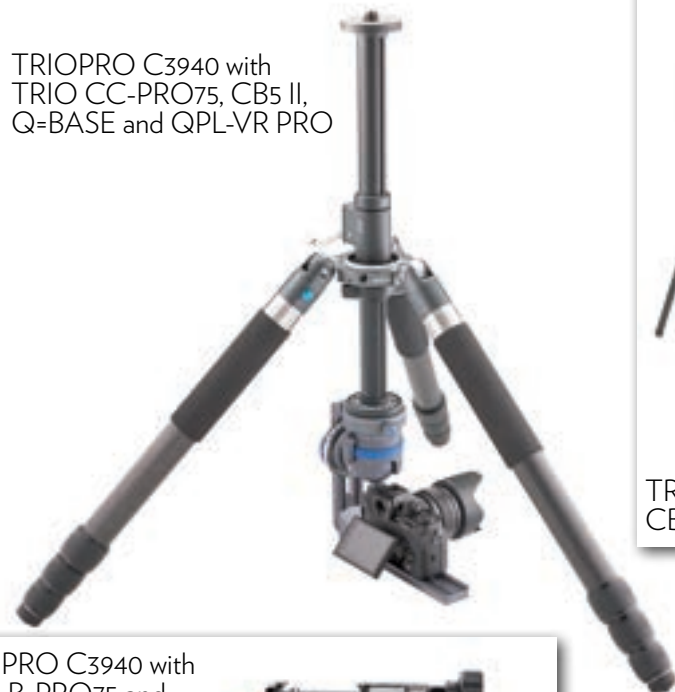
TRIOPRO C3940 with TRIO CC-PRO75, CB5 II, Q=BASE and QPL-VR PRO