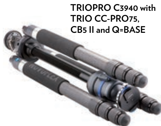
TRIOPRO C3940 with TRIO CC-PRO75, CB5 II and Q=BASE