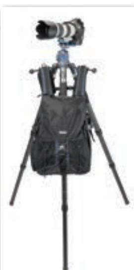
TRIOPRO C3940 with CB5 II and Q=BASE