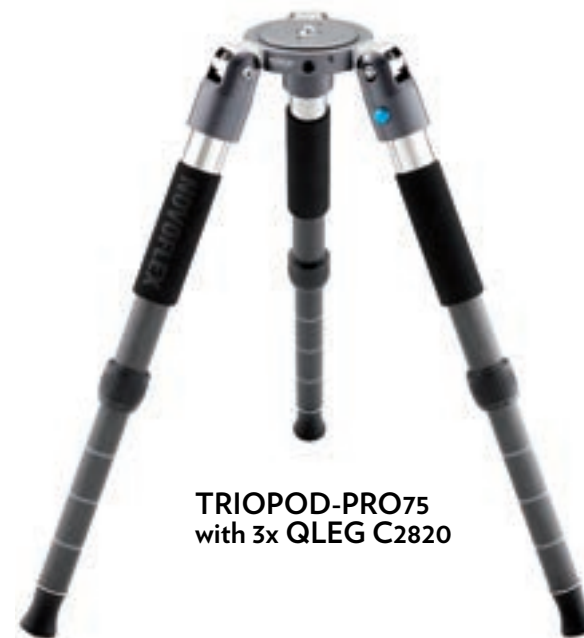
TRIOPROD-PRO75 with 3x QLEG C2820

For extreme loads and maximum stability, the short carbon legs QLEG C2820 with a length of 26.5cm - 42.5cm (10 in. - 17 in.) and two segments are recommended. These legs are the ideal choice when working near-ground and, because of their low length, yet they are extremely sturdy. All legs are equipped with removable steel spikes with 3/8" threads, which are covered by rubber feet.