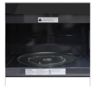
1.6 cu. ft. Interior