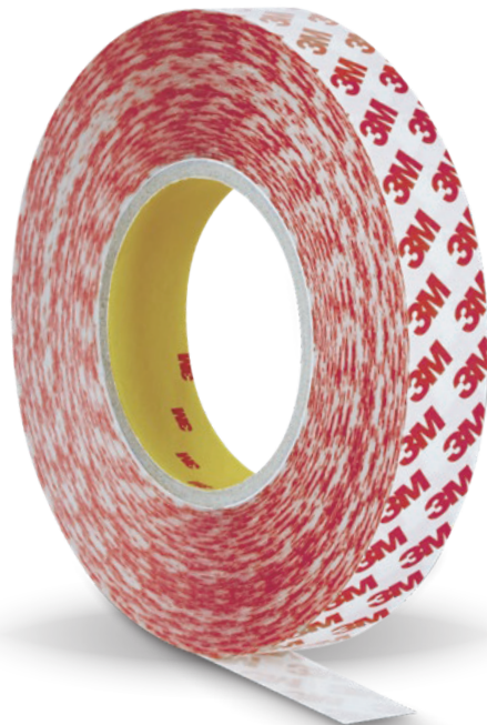
3M™ Double Coated Tape GPT-020