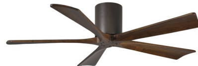
Shown in textured bronze / walnut tone