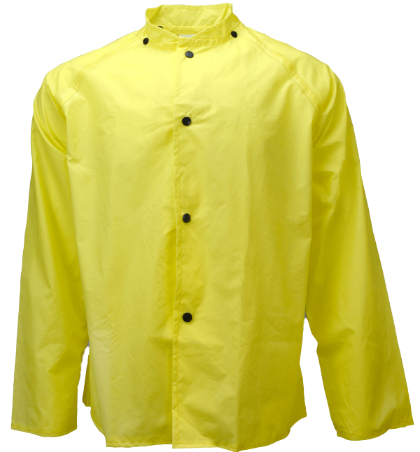
With or Without Attached Hood