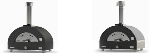
Black Powder Coat Stainless Steel