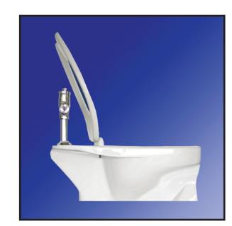
External check hinge stops seat 11 degrees beyond vertical