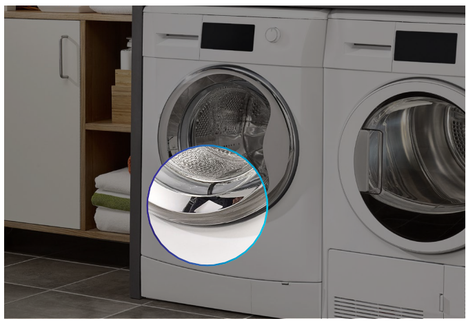
Bonds stainless steel to glass