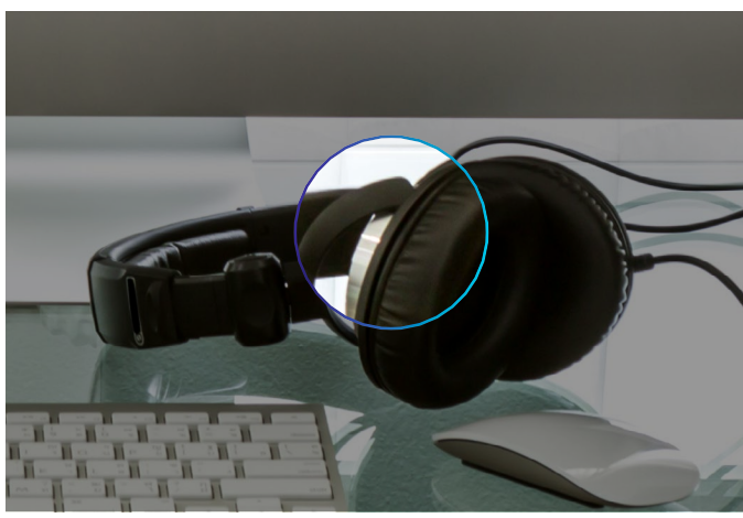
Bonds foam to fabric