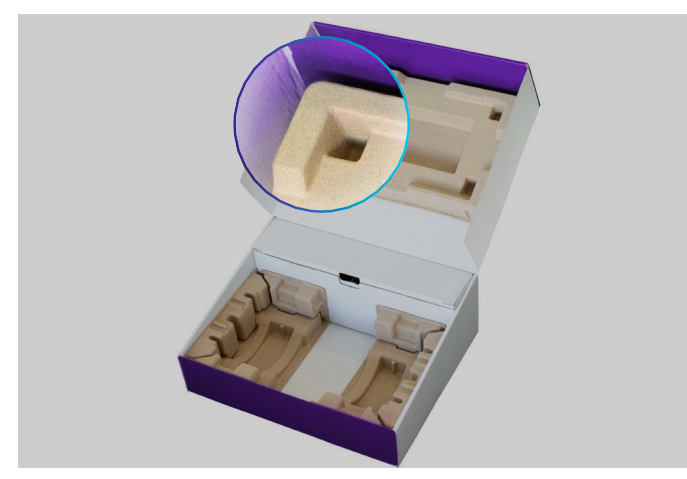
Bonds molded fiber to paperboard