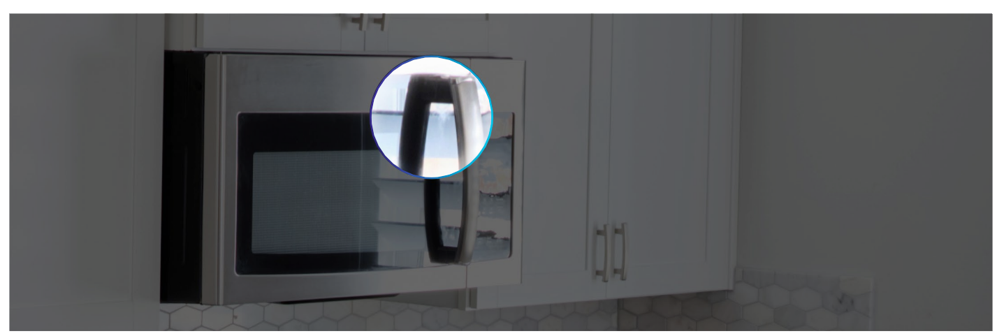
Bonds stainless steel to metal

Discover the power of our conformable double coated tissue tapes, which provide high-quality bonding and reworkability on many substrates. Exceptional clarity* and excellent performance in various environmental conditions, such as low temperature, make it an ideal choice for both interior and exterior bonding applications.