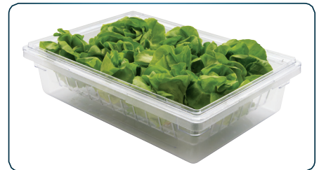
PFSF-5C with PFSF-6