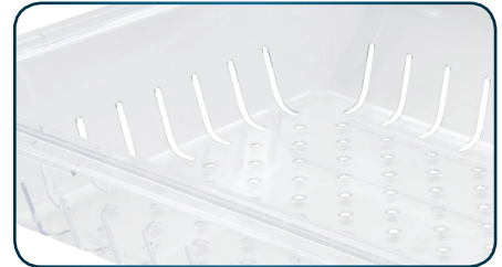
Perforations along bottom and all sides