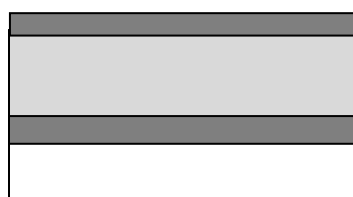
Black PET Film (Optional) Composite Magnetic FFDM Layer Acrylic Adhesive (Optional) PET Film Release Liner