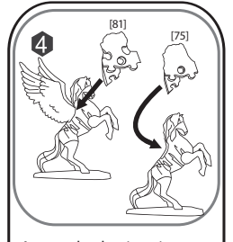
A spare body piece is provided when the wings are not being used.

turn gently to lock using the key enclosed.