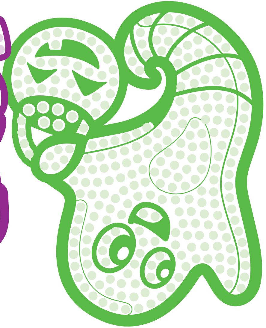
Gem Placement Guide

Celebrate the season by making and sharing a handmade Halloween craft.