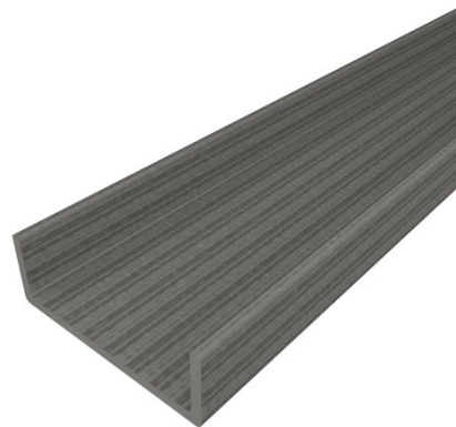
Cable Channel Tray