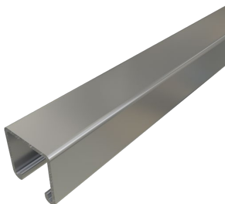
Figure 1: Steel strut and fittings products

Product identification: Steel strut and fittings products made of steel.