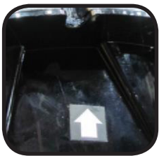
Ensure arrow points upward for proper beam