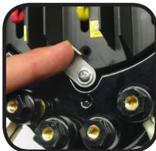
To remove the terminal block, first pivot the latch