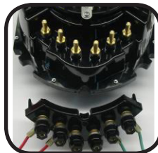
The terminal block can then be pulled by hand