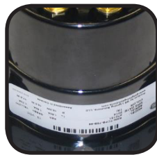
Check label for required voltage