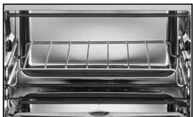
Lower Broil Position