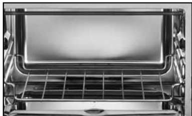
Lower Rack Position