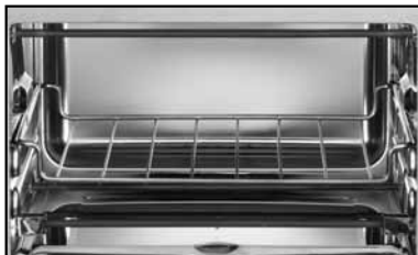
Middle Rack Position