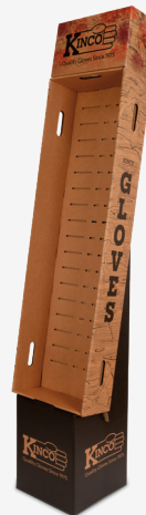
FLOOR DISPLAY METHOD