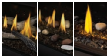
Collection of optional media kits for enhanced appearance – beach fire, mineral rock, woodland