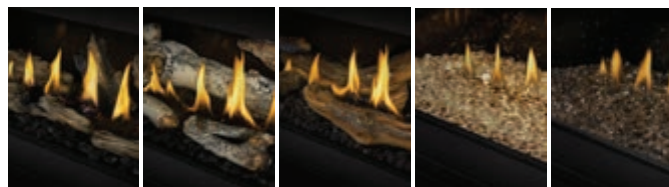
Contemporary design with choice of media – birch, driftwood, split oak log kits or glass