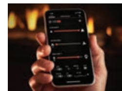
Compatible with the eFIRE mobile app controlled by Bluetooth technology