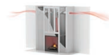
Optional passive Universal Heat Management System ensures efficient and silent heat circulation, allowing for a reduced TV installation height