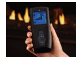
Remote included to control on/off, thermostat, flame, fan, top lights and more