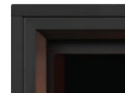
Enjoy a frameless design with included flange or choose the optional 4pc. trim