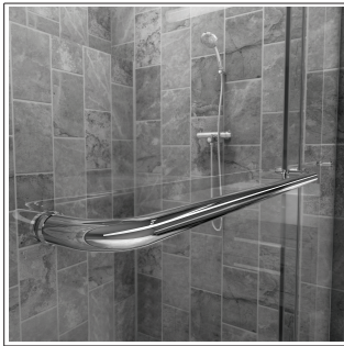
Shower Door Handle