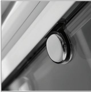
Shower Door Roller