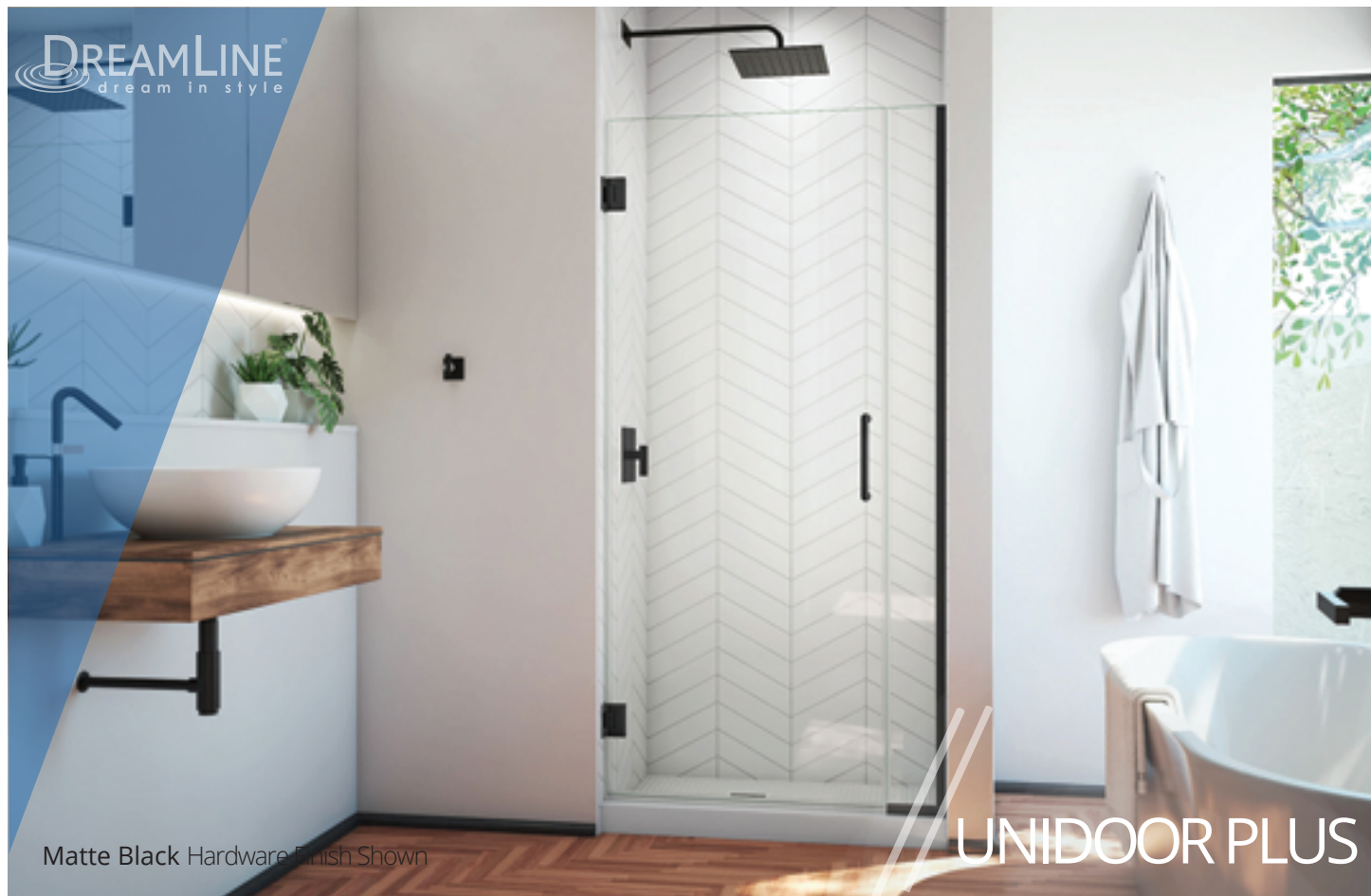
Matte Black Hardware Finish Shown