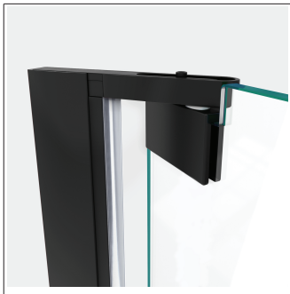
Door Top Pivot