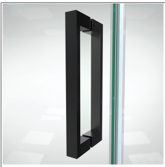
Shower Door Handle