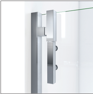
Shower Door Top Pivot