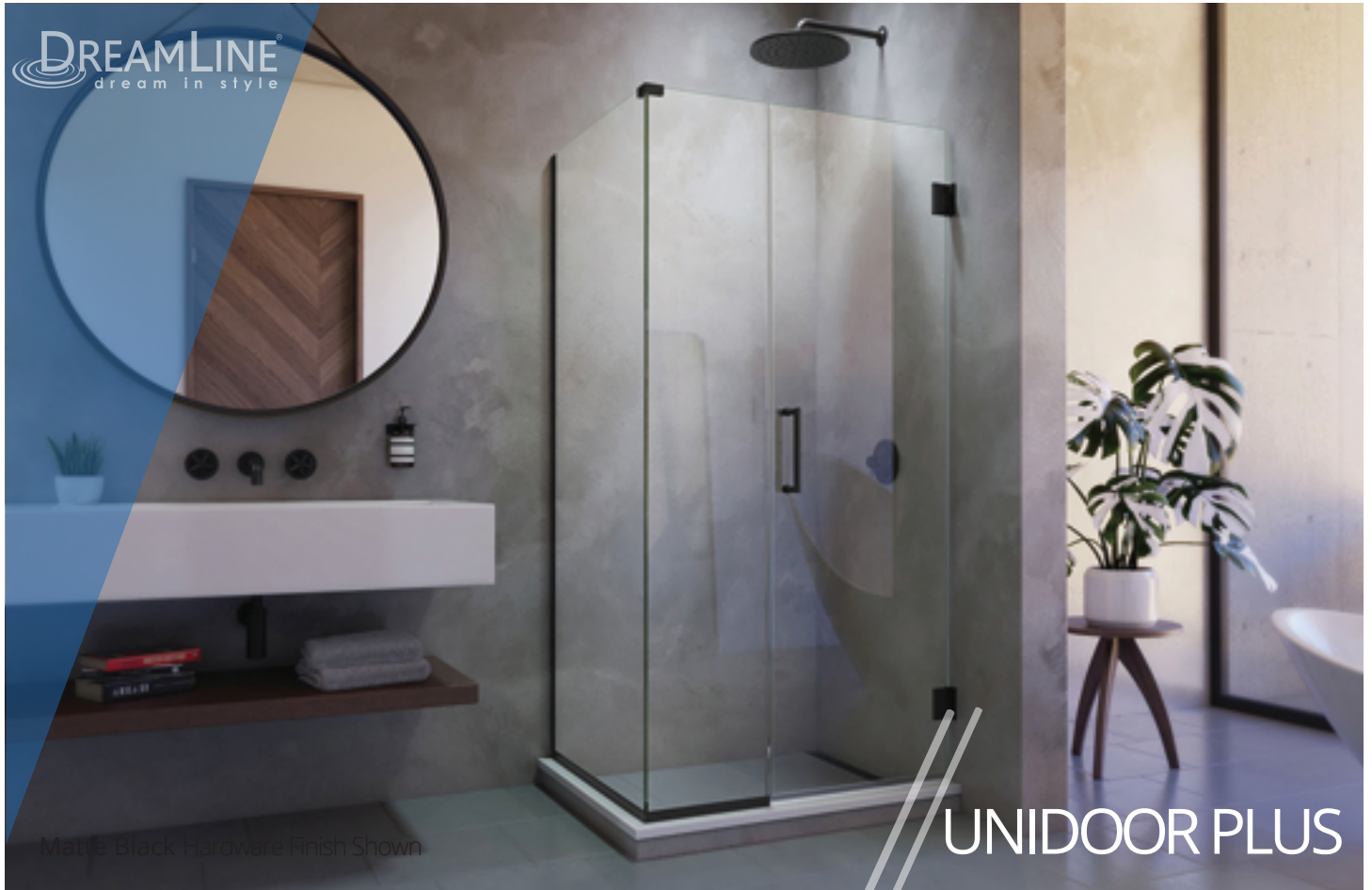
Matte Black Hardware Finish Shown