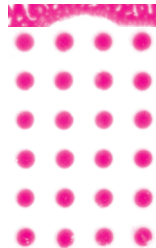
Plate contains mostly solids in a combination of solid and halftone images.

Slightly more solids in a combination of solid and halftone images.