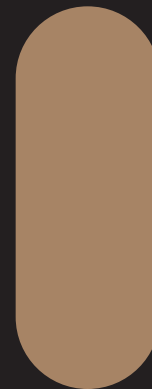
11 Series Process