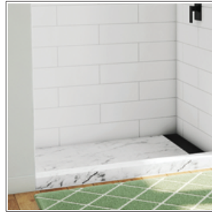
Base Is NOT included

The DreamStone collection offers popular horizontal subway patterns without the hassle of difficult installation. The durable, non-porous solid surface material makes DreamStone wall panels resistant against mold, chips, and cracks while maintaining its beautiful color for years to come.