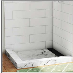
Base Is NOT included

The DreamStone collection offers popular horizontal subway patterns without the hassle of difficult installation. The durable, non-porous solid surface material makes DreamStone wall panels resistant against mold, chips, and cracks while maintaining its beautiful color for years to come.