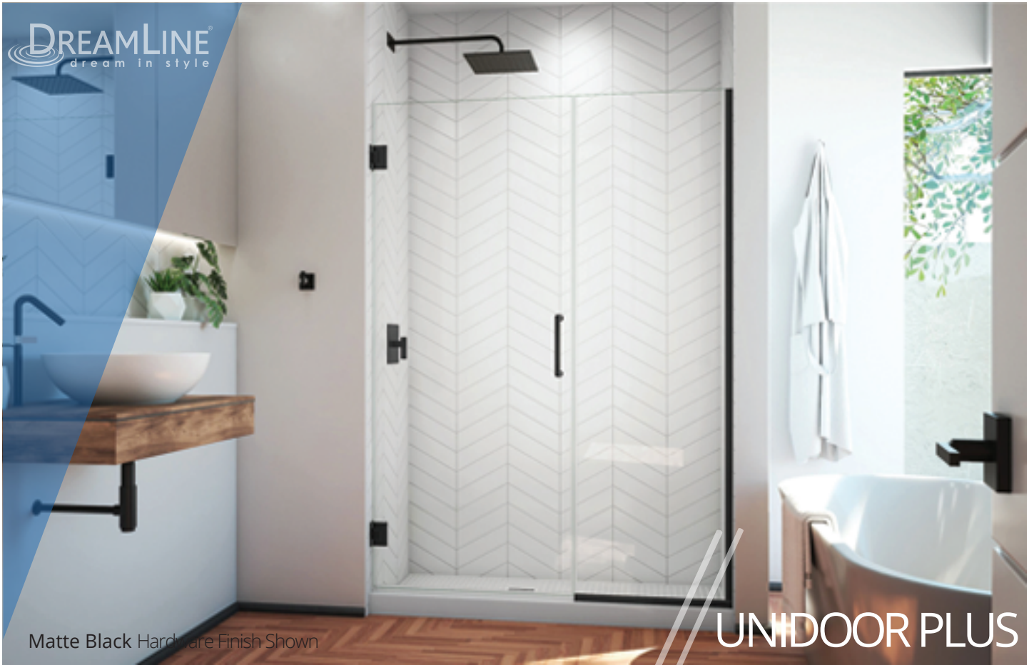
Matte Black Hardware Finish Shown