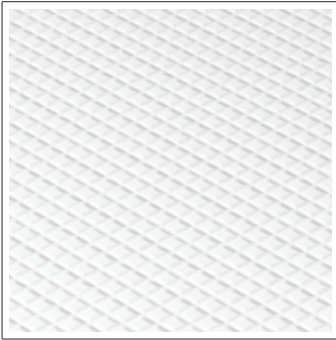
Shower Base Texture