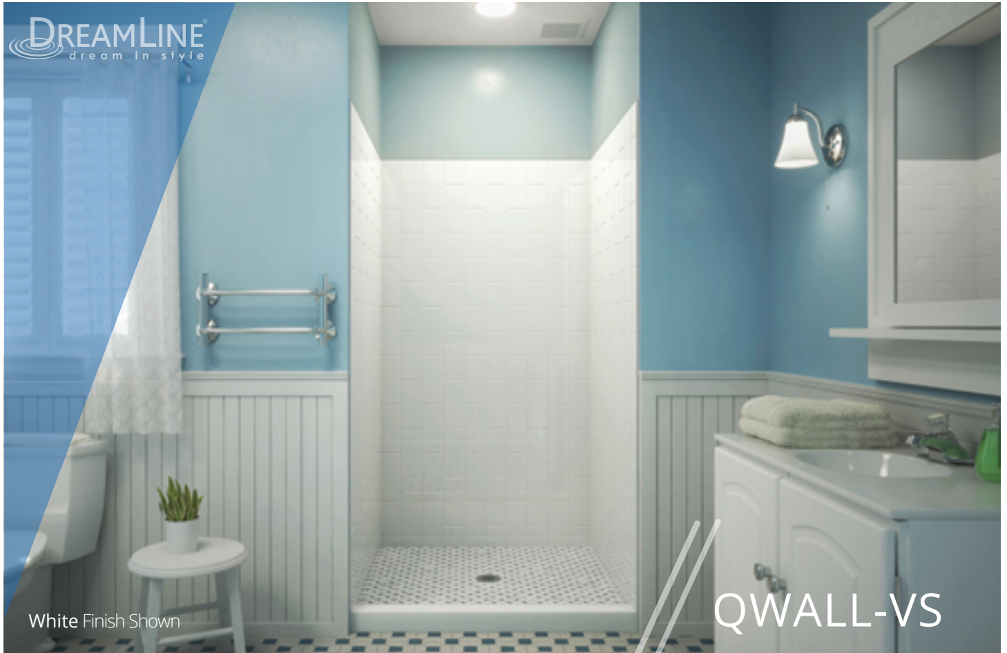
White Finish Shown