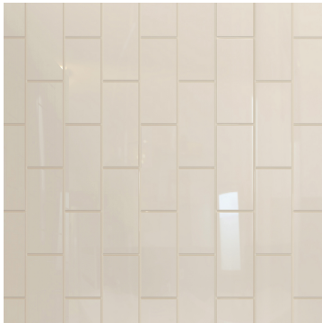
Q-Wall Subway Tile Pattern