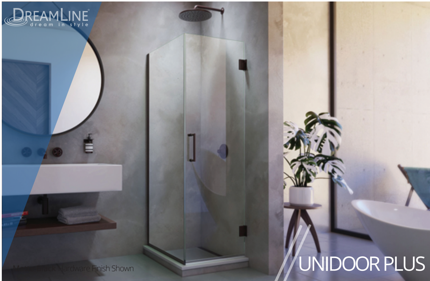
Matte Black Hardware Finish Shown