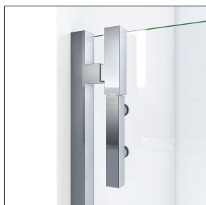
Shower Door Top Pivot