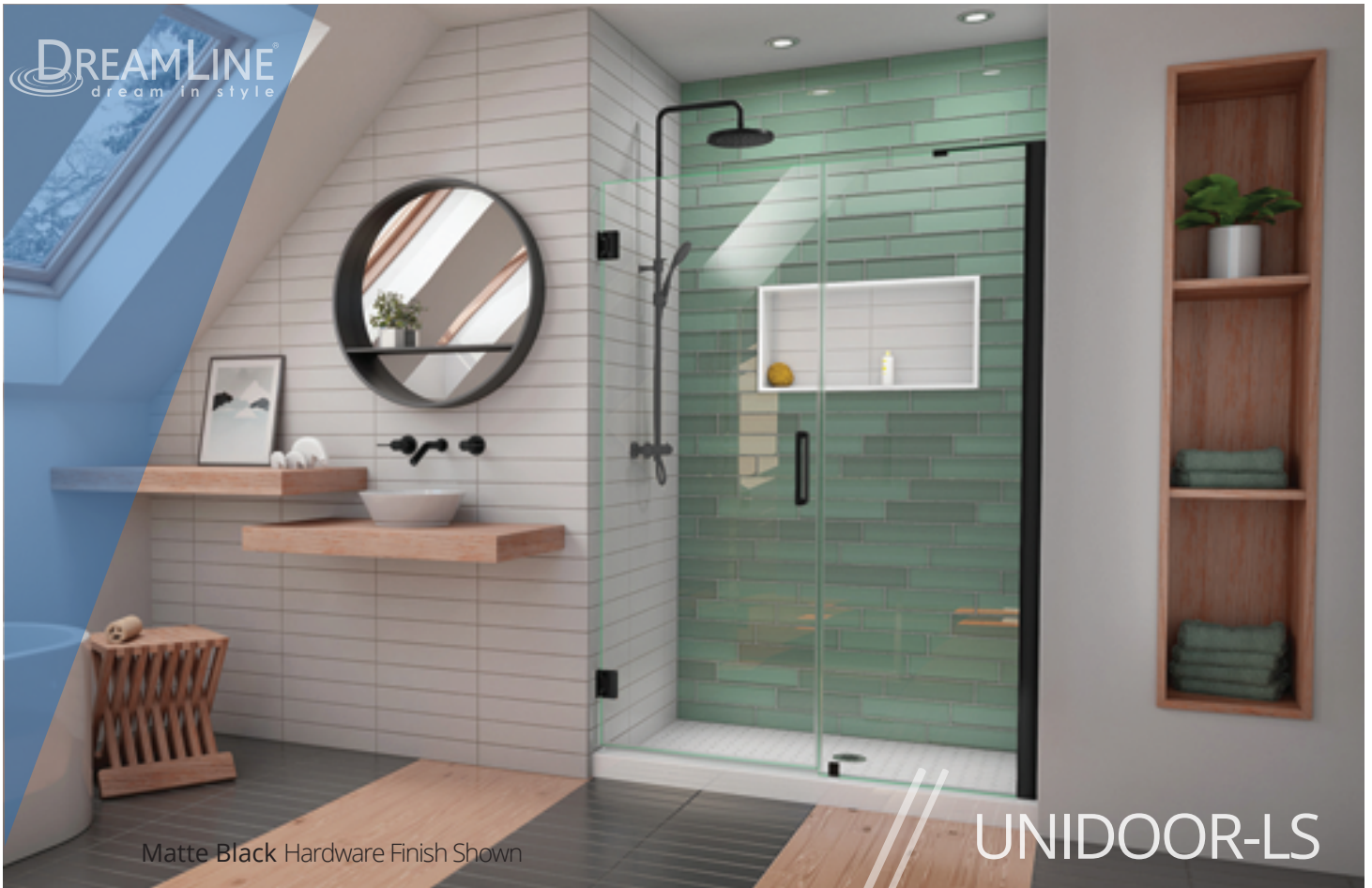
Matte Black Hardware Finish Shown