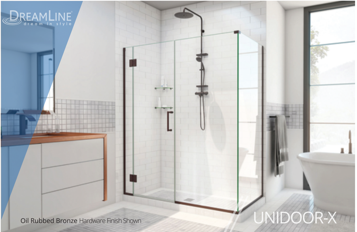
Oil Rubbed Bronze Hardware Finish Shown