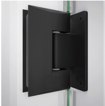
Solid Brass Self-Closing Hinge

DreamLine exclusive ClearMax water and stain resistant glass coating