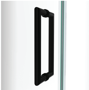
Shower Door Handle

If this unit is going to be installed in a new construction, please, install all of the required plumbing and drainage before installing the shower. Use a competent and licensed plumber for all plumbing installation period.