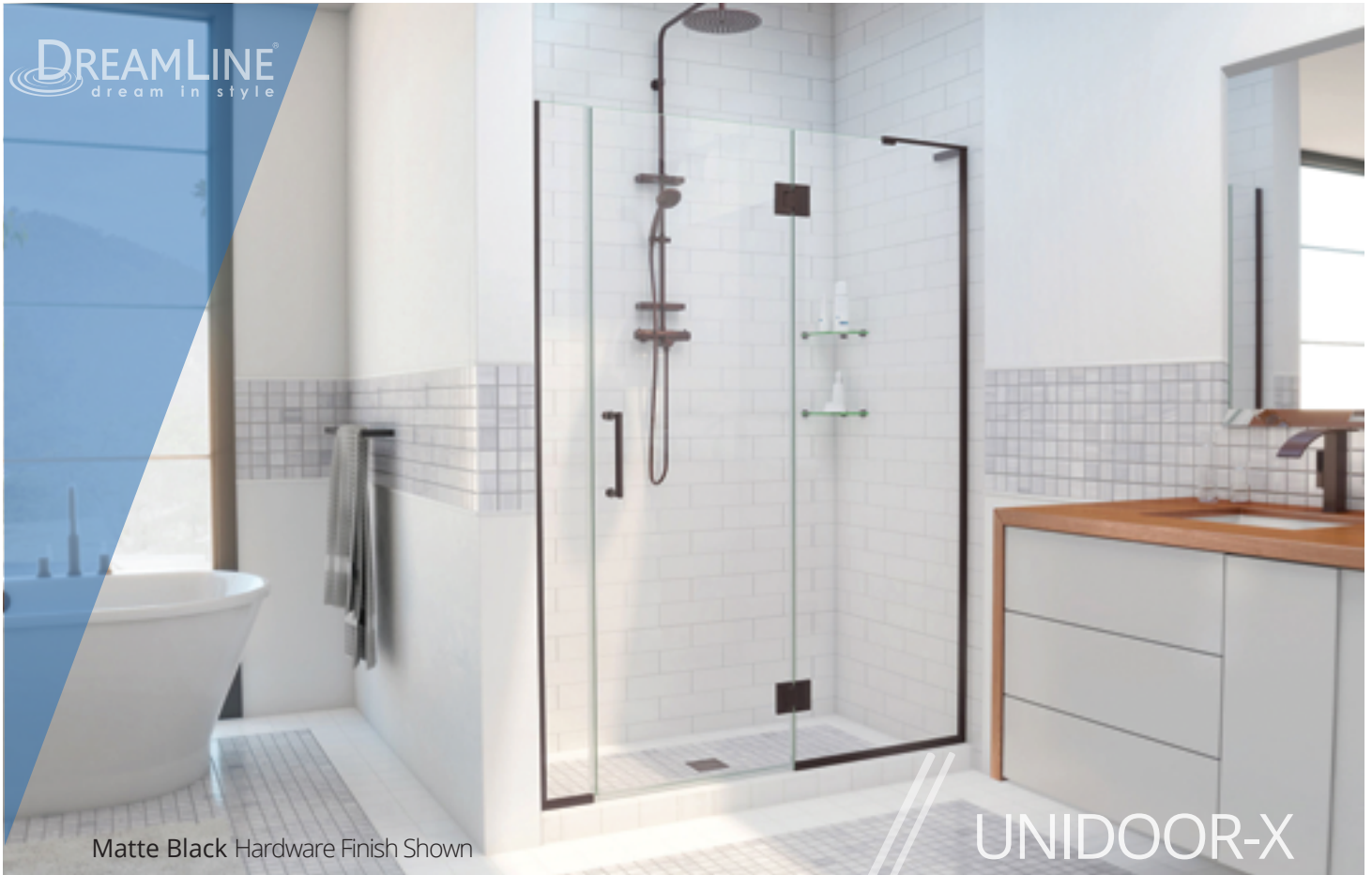
Matte Black Hardware Finish Shown