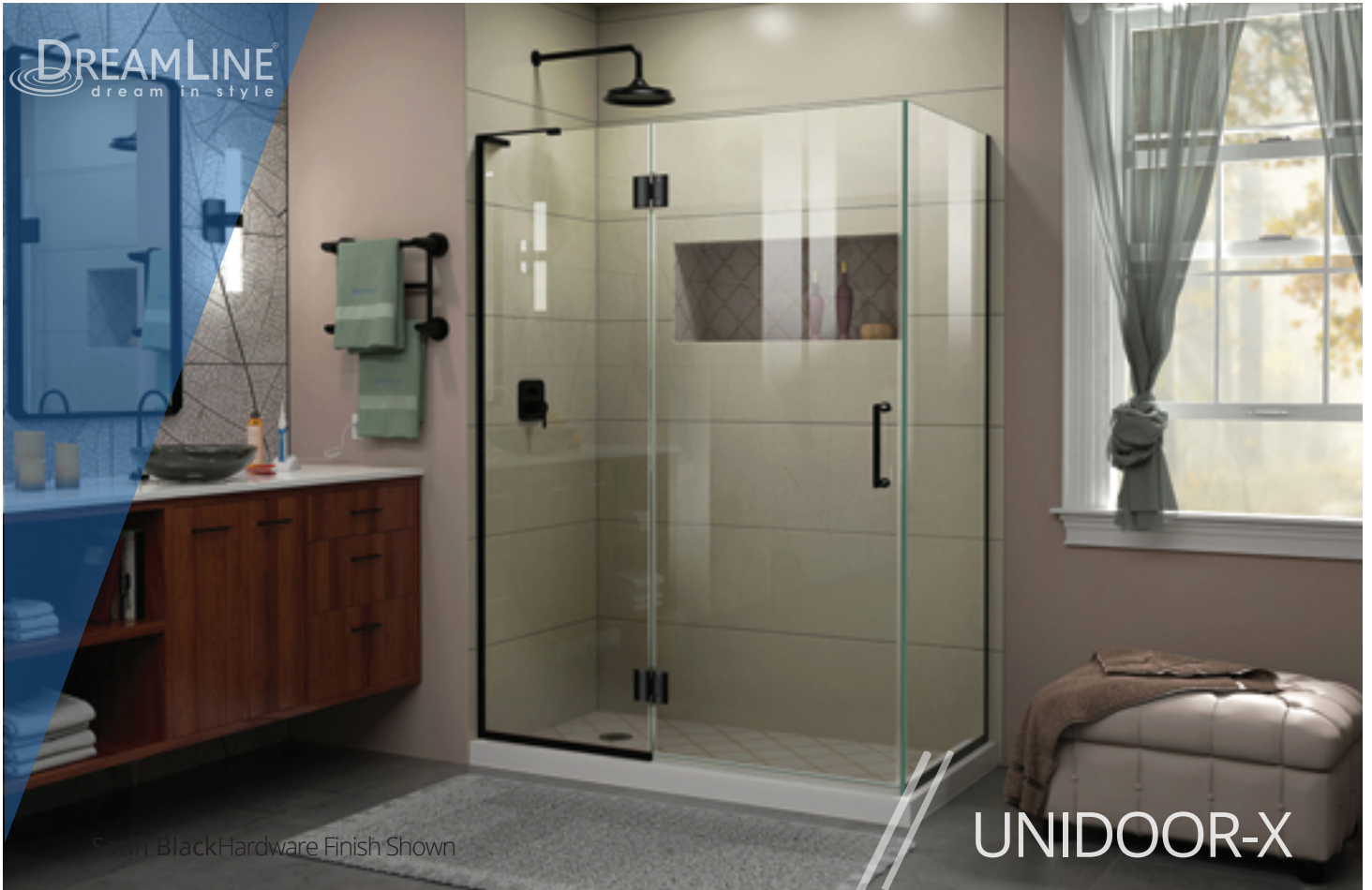
Shown in Black Hardware Finish Shown