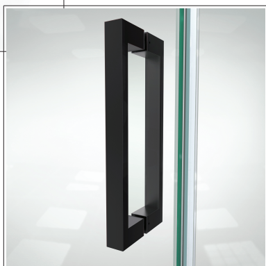
Shower Door Handle