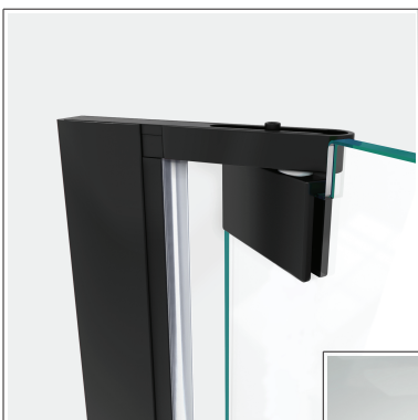
Door Top Pivot