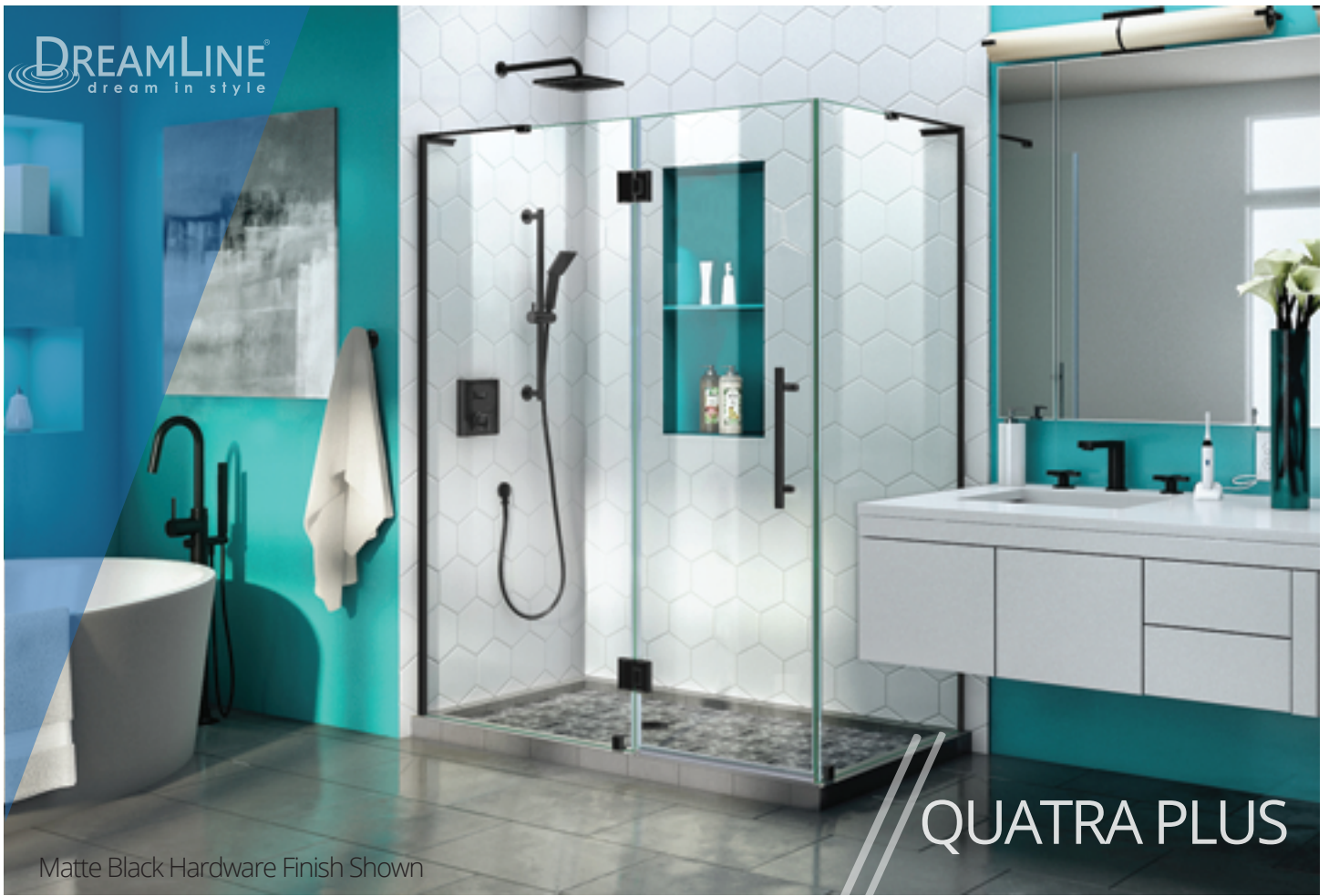
Matte Black Hardware Finish Shown