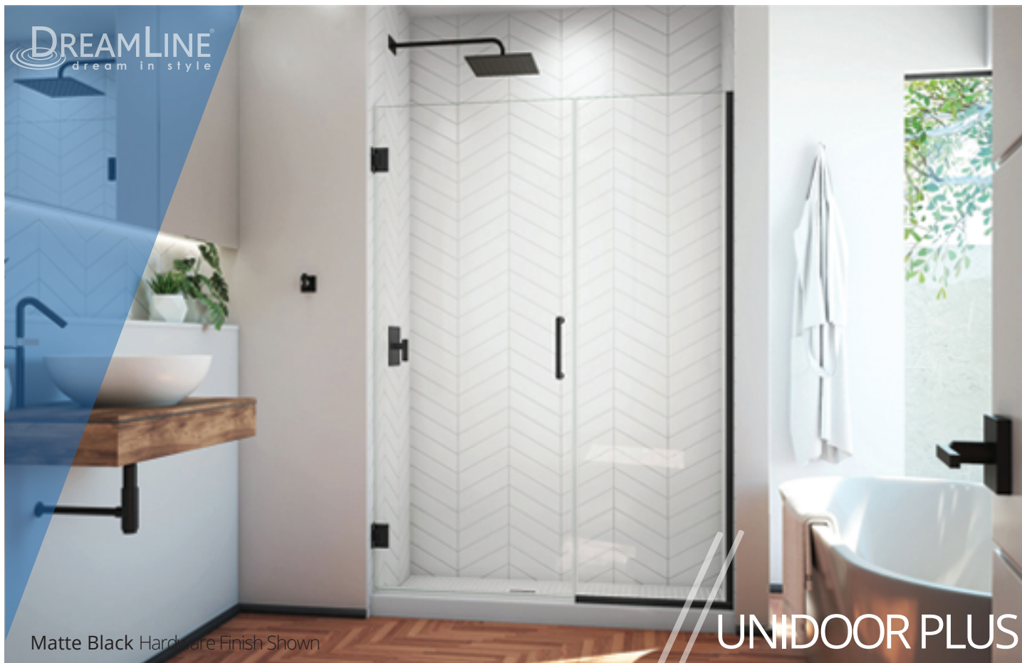
Matte Black Hardware Finish Shown